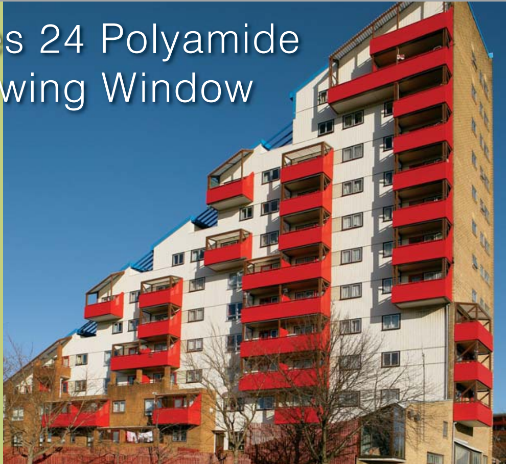
Award nominated Tom Collins House, Newcastle – Client: YHN – Architect: City Design

The AM Series 24 Polyamide Thermaswing Window is a high performance open out aluminium window designed for new build and refurbishment projects. The sections and hardware are designed to be robust and hard-wearing.